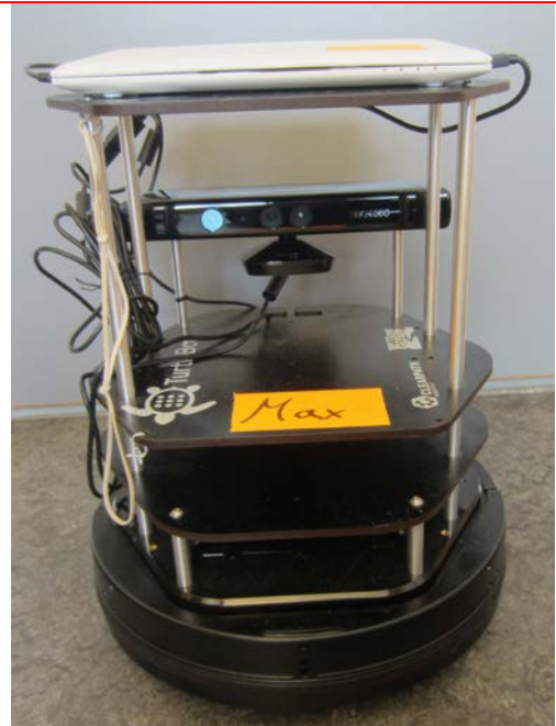
Fig. 1 Turtlebot should look like this.

This red box will say if the demo requires just Turtlebot or also a remote computer