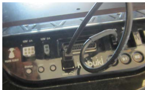
Fig. 2 Back of Turtlebot.