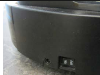
Fig. 3 Turtlebot power button (off).